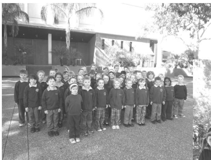
Both Infants and Senior Choir at the Eisteddfod