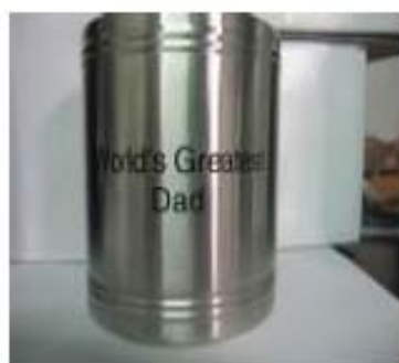
Stainless Steel Can Holder