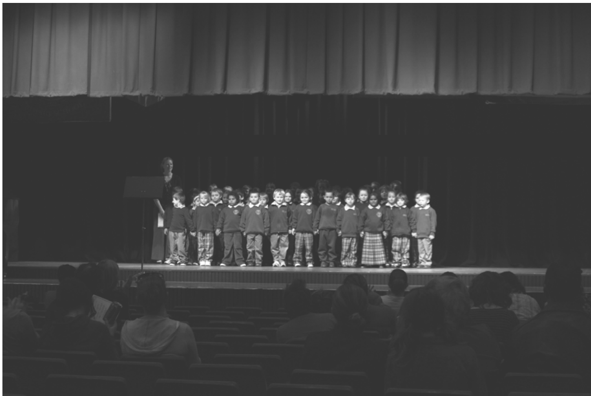
Infants Choir at Choral Festival