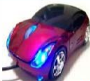
Ferrari Internet Optical Mouse