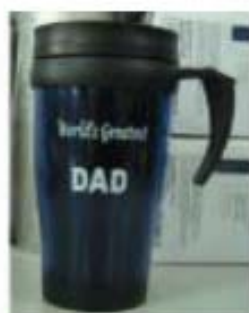
Travel Mug Blue WGD