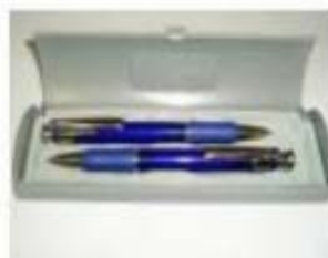
WGD Twin Pen Set Boxed