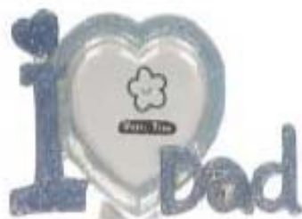
Frame I Love Dad