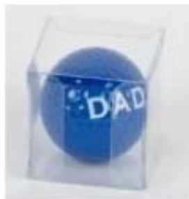
Single Golf Ball Boxed