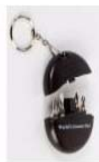
Key Ring Mini Tool WGD