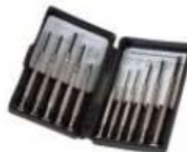
Precision Screw Driver Set