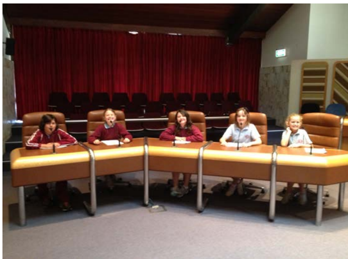
Future Leaders. Girl Power !!!!!!!!!!!!!!!

On Friday 3/4V had the opportunity to see how the local City Council operated as part of their H.S.I.E unit on Local Government.