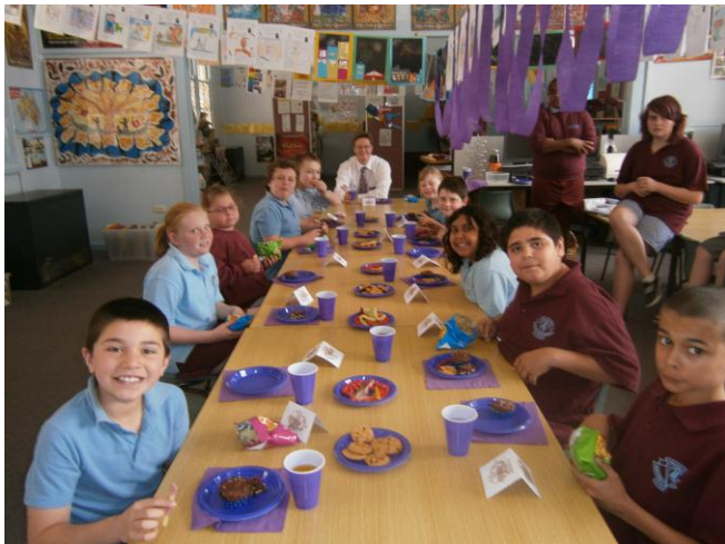
Book Week Prize Winners morning tea