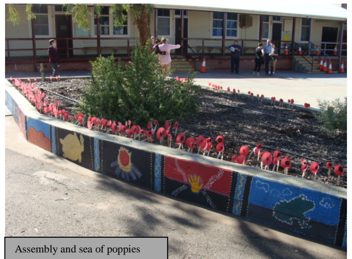
Assembly and sea of poppies