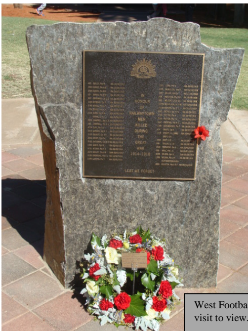
West Football Club Memorial and students visit to view.